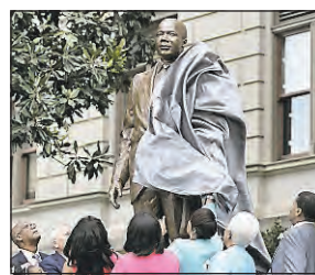
ATLANTA MLK statue unveiled at Georgia Capitol Nation+World » All